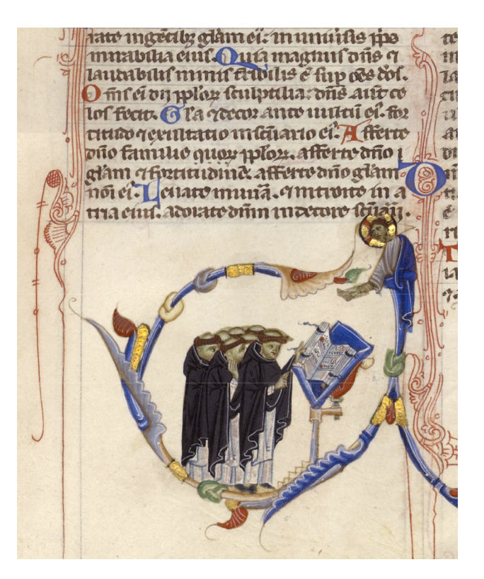
MONDAY, 6 MARCH -